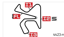
Circuito de Jerez - Ángel Nieto